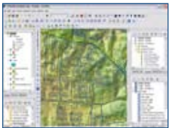
ArcGIS, AutoCAD, MicroStation, and stand-alone environments within one single product

WaterGEMS® is a hydraulic and water quality modeling solution for water distribution systems with advanced interoperability, geospatial model-building, optimization, and asset management tools. From fire flow and constituent concentration analyses, to energy consumption and capital cost management, WaterGEMS provides an easy-to-use environment for engineers to analyze, design, and optimize water distribution systems.