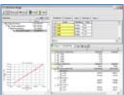
WaterGEMS' Darwin Calibrator module saves time and money by quickly giving you a calibrated model

WaterGEMS' included LoadBuilder module helps engineers allocate water demands based on GIS water consumption data from any point, line, or polygon feature using customer meters, lump-sum demand distribution, population-estimation polygons, or utility meter routes.