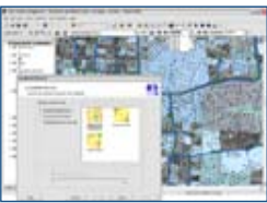
Use LoadBuilder to allocate demands using customer meters, service polygons, and more.

Out of the box, WaterGEMS users can enjoy the easy-to-use Windows stand-alone interface – or choose to work directly inside ArcGIS, MicroStation, or AutoCAD. Utilities and consultants can share a single dataset using different interfaces, and modeling teams can leverage the skills of engineers from different departments. Engineers can flatten learning curves by choosing the environment they already know and provide results that can be visualized on multiple platforms.